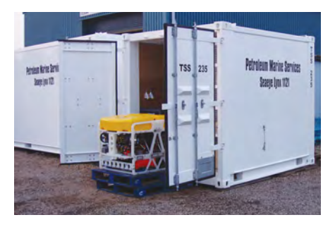
Safe Area or Zone 2 ratings are available.

Surface control equipment can either be installed directly in the customer's facility or integrated into a custom ISO control cabin. A range of control cabins, workshops and storage containers are available and can be adapted to suit customer-specific requirements.