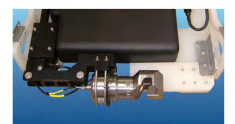
CABLE CUTTER SKID