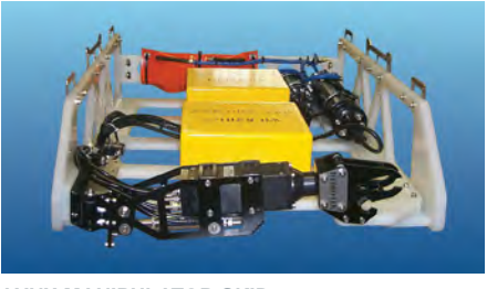
LYNX MANIPULATOR SKID