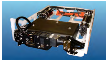
TIGER MANIPULATOR SKID